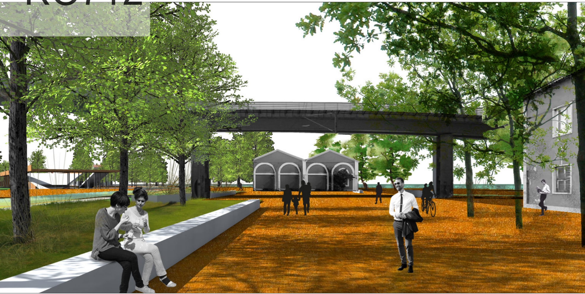
Links with the city: the overpass as a gate to the riverside park