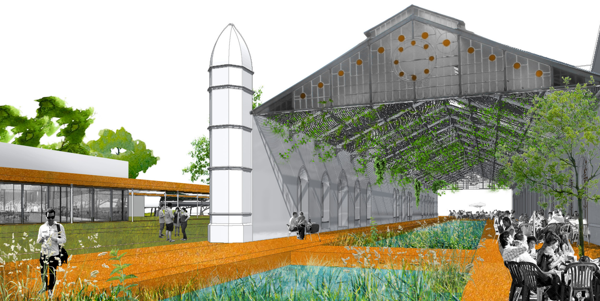
Low paths : the former railway platform leading to a local agriculture and fishing restaurant