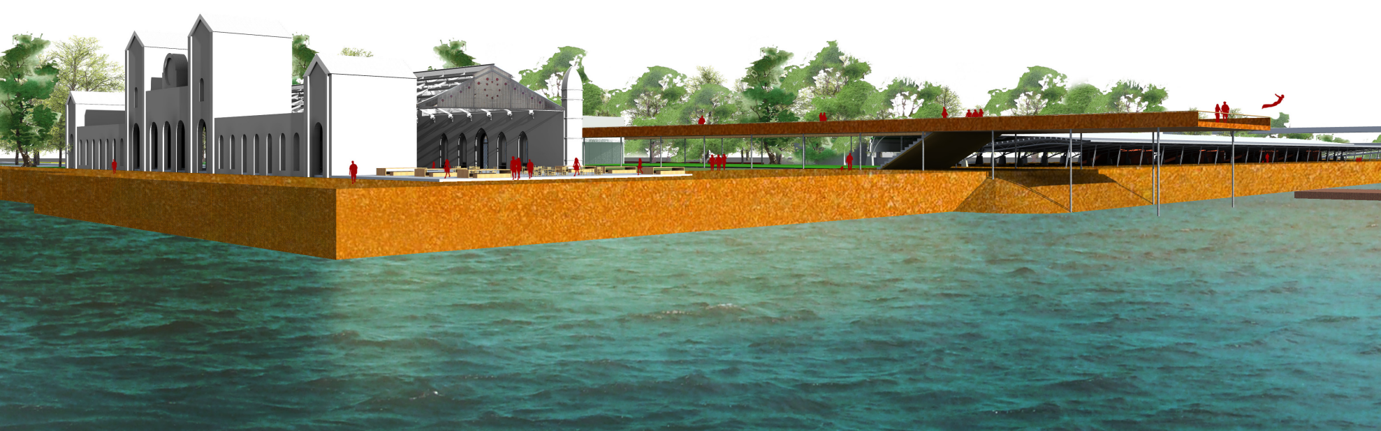
High paths : views on the distant landscape