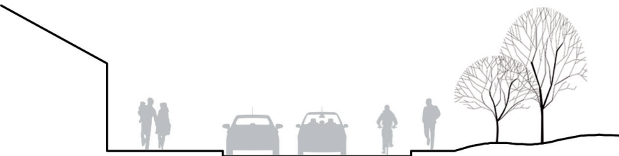
Access road 1:200