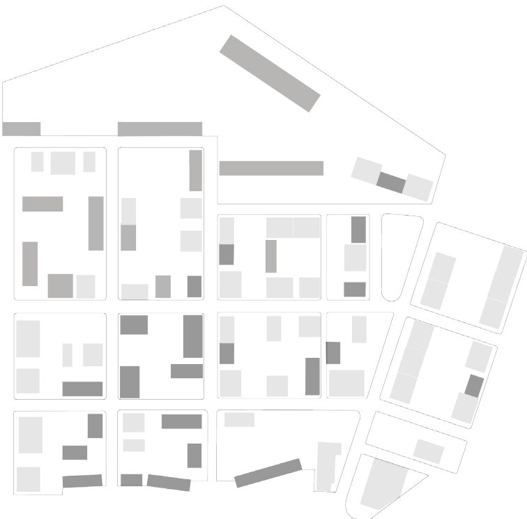
Existing houses (light grey) New flexible housing (dark grey)