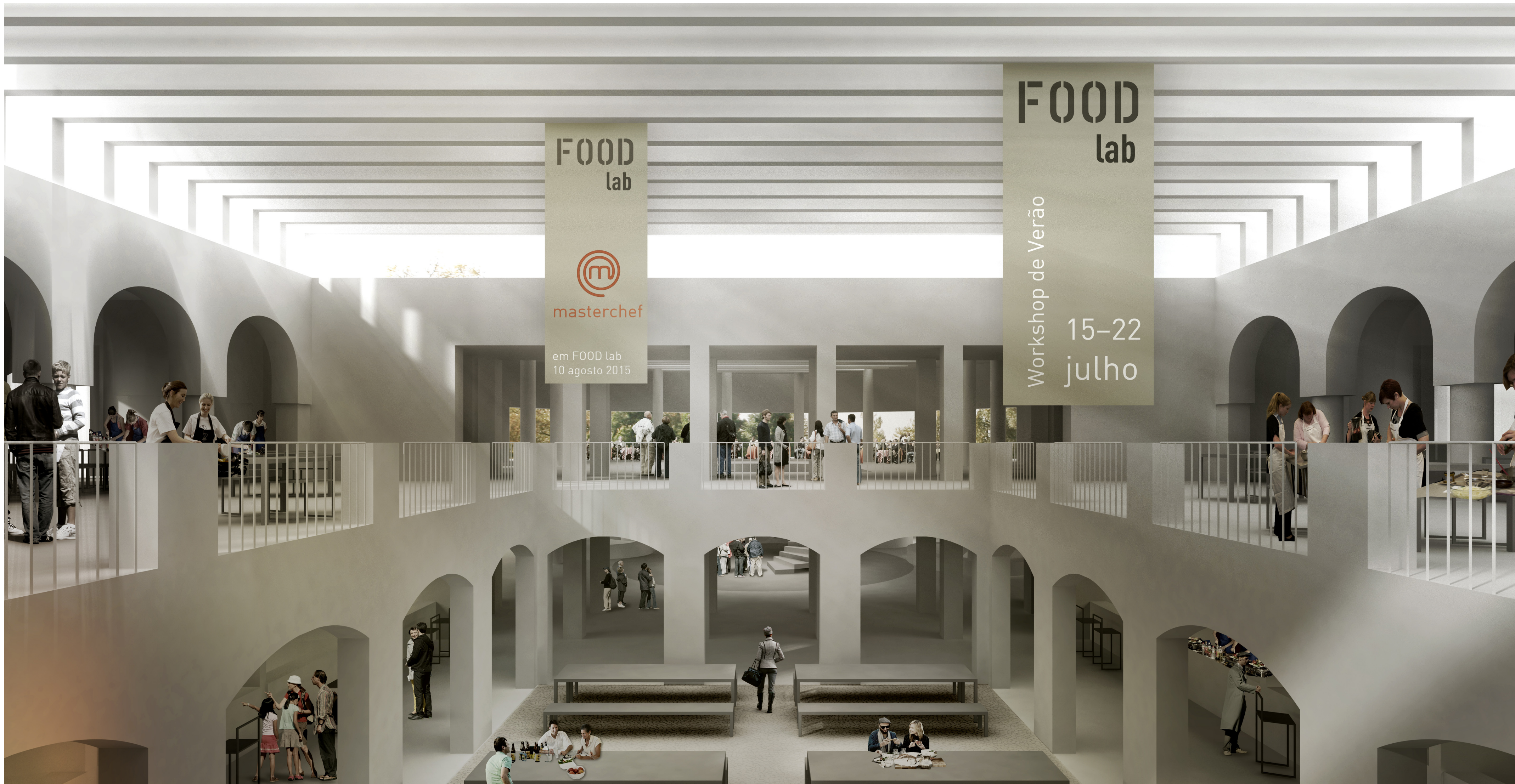
FOODlab interior view towards food court and culinary school